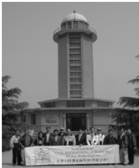
Group photo at Geodetic Origin Tower

The following is extracted from ICES Region News, written by Eric Lo: