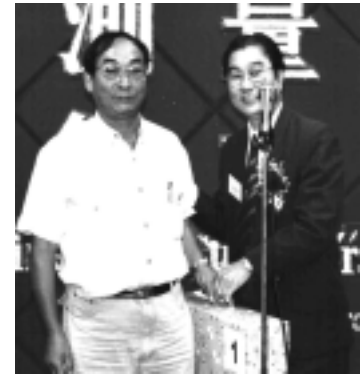
Right: First prize Winner of lucky Draw