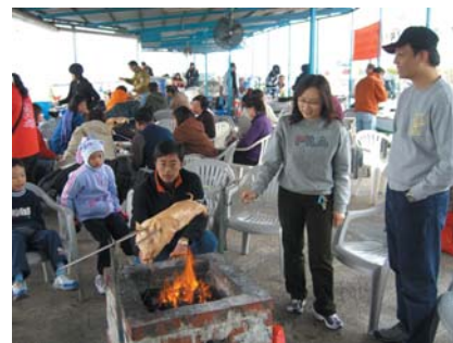
Oh dear, it sucks -the pig I mean!