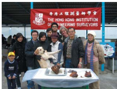
Don't burn me please - the dog said!