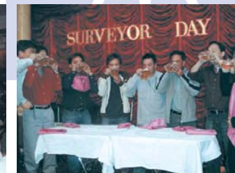
Beer Drinking Competition