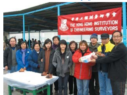
Here's the group winner!