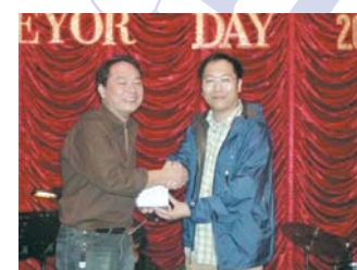
Oh no! Win again!