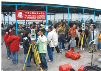
Ummm! What's new?