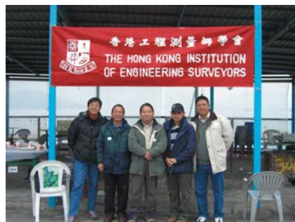
Hurray! We're here!

On 8 th January 2006 (Sunday) 78 members and their family members gathered in Whitehead Club in Wu Kai Sha participating the social function - Technical Demonstration and Barbecue . Although we have been working in the industry for years, most of our family/friends might not know what 'Engineering Survey' is. This served a good opportunity to promote the survey profession and enhance communication between members and their family/friends. Experts from Leica Geosystems Ltd presented their SmartStaton with some technical demonstration. Guests showed their interest in the members' profession very much. Moreover, participants enjoyed a nice afternoon with barbecue, group family games, golf exercise, bicycle riding, flying kites and so on.