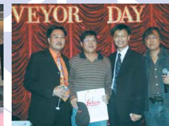
Grand Prize Winner