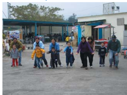
Get Set Go.....!