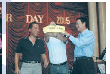
Who's got the Misclosure?