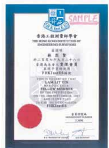
Outlook of the new HKInstES membership certificate