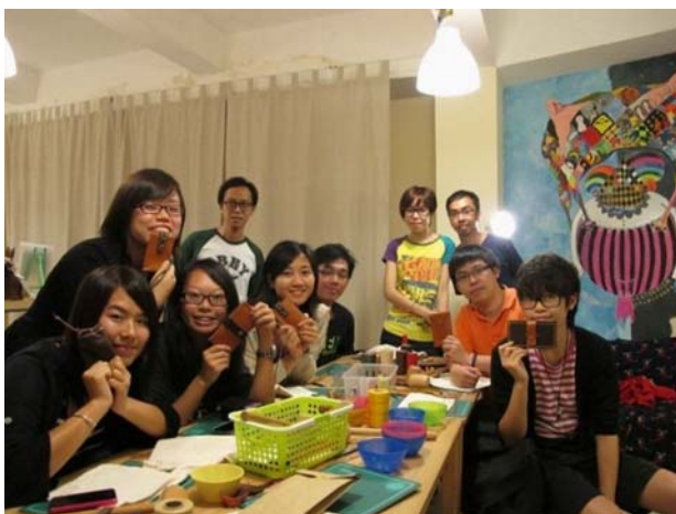
Group Photo for the leather workshop