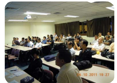
Participants are concentrated on the seminars

As a whole, unmanned aerial vehicle UAV can be classified into three different types: fixed wing, rotate wing and no wing. Among them, no wing UAV will be more suitable for developing countries. This is because the operation cost is much lower than the others. Based on the case in Lao, no wing Blimp type UAV for low elevation aerial photo capturing was being discussed and explained in detail.