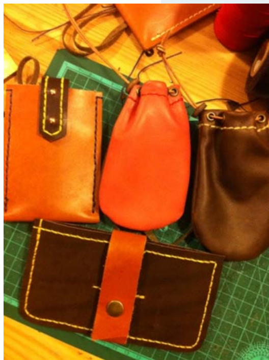
Some finished DIY products