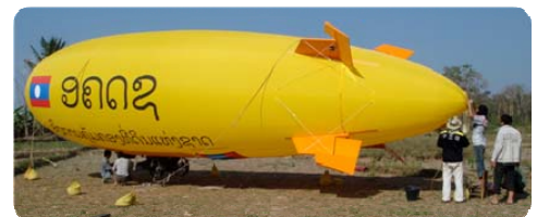
Blimp type UAV in Lao

in some places where skyscrapers are all around. Therefore, implementation in Hong Kong seems not feasible.