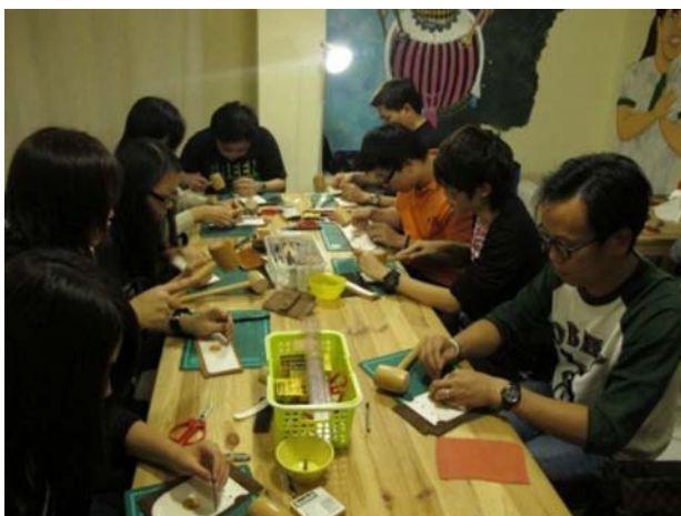
All Participants worked on their masterpieces